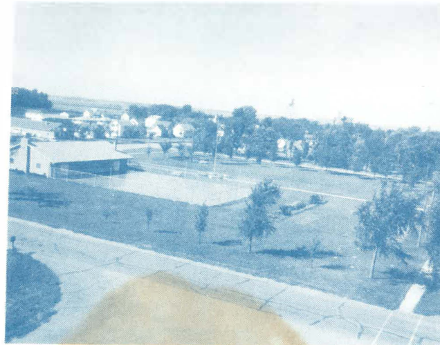
City Park with Roller Rink and Auditorium