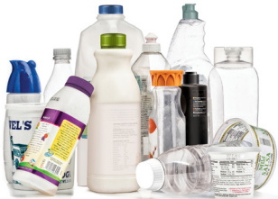
Plastic Bottles & Containers Botellas y envases de plástico