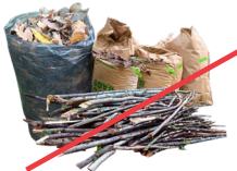
NO Green Waste NO desechos verdes