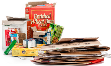
Flattened Cardboard & Paperboard Cartón y cartulina aplastados