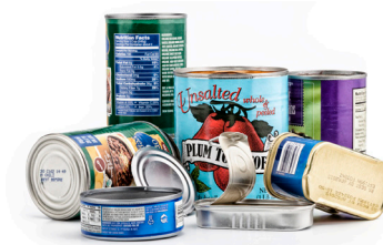
Food & Beverage Cans Latas de alimentos y bebidas