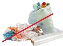
NO Loose Plastic Bags, Bagged Recyclables or Film Empty recyclables directly into your cart NO bolsas y envolturas de plástico sueltas, o materiales reciclables embolsados Vacié directamente los materiales reciclables en nuestro carrito