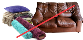
NO Clothing, Furniture & Carpet NO ropa, muebles y alfombras