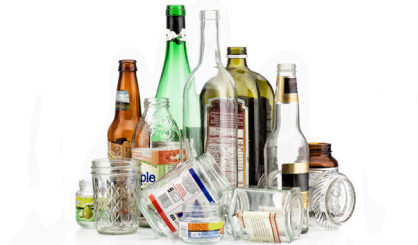
Glass Bottles & Containers Botellas y envases de vidrio

DO NOT include in your mixed recycling container: NO incluir en su contenedor de reciclaje mixto: